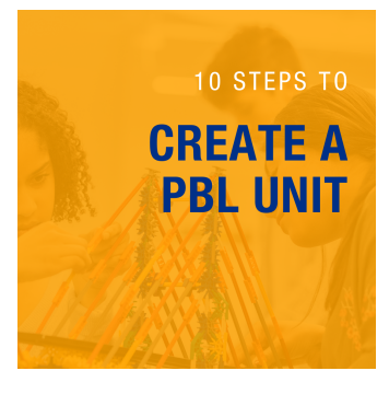
Want to start using PBL in your class but don't know