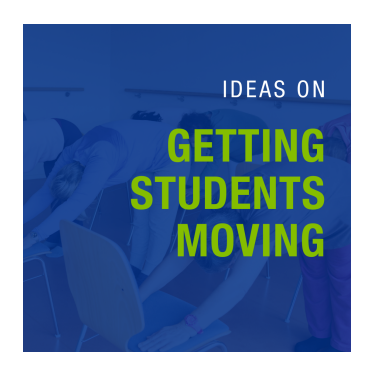
How can you get your students up and moving in

For each of the following articles, we have also included an audio version to make getting these tips more convenient than ever.