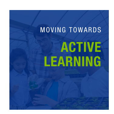
Active learning moves past hands-on learning